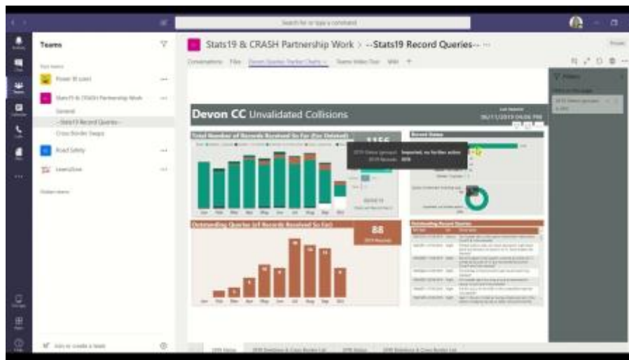
4 - The Teams video help guide which shows you around the site we've created

Some more benefits we found along the way